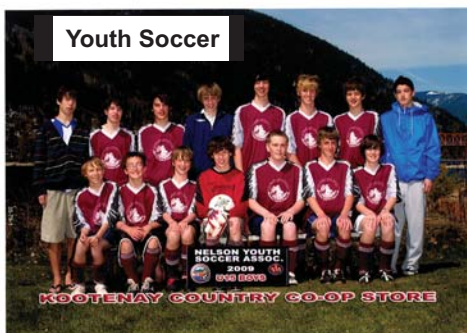
The Co-op sponsors an adult and a youth soccer team.

The Environmental Fund was awarded to KCAP - Kootenay Citizens for Alternative to Pesticides