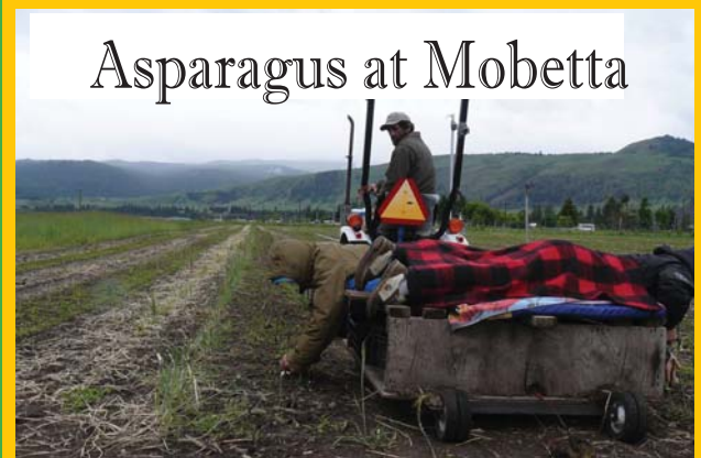
Asparagus at Mobetta